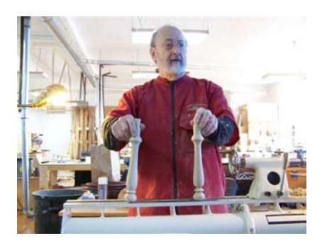
Spindles by Colson